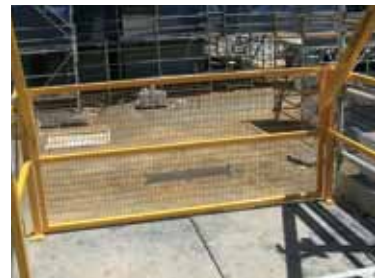
Watergate incorporated into scaffolding on a building site

“ We have installed seven Watergate Safety Gates in our paint manufacturing plant. As well as the all important safety aspect, we have gained significant improvement in productivity. ”