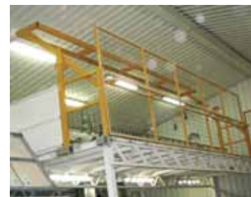
The Watergate Safety Gate in the load (top image) and unload (bottom image) positions.